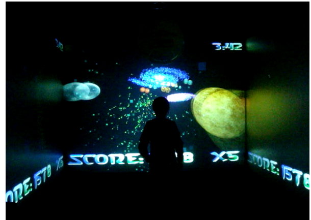
Figure 1: A child with autism playing Astrojumper using a three-wall rear-projected immersive display.

Modern methods to address behavioral difficulties for children with autism include overcorrection of behavior [10] and altering